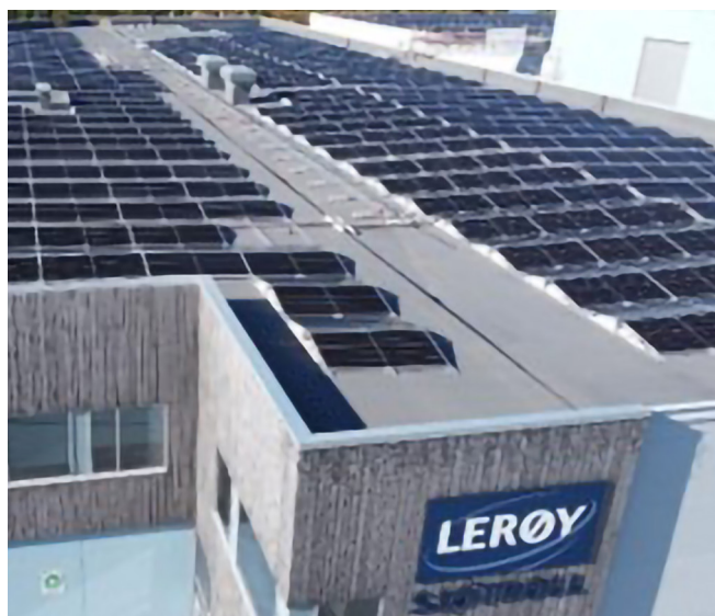
Solar panels at Kjærrelva.