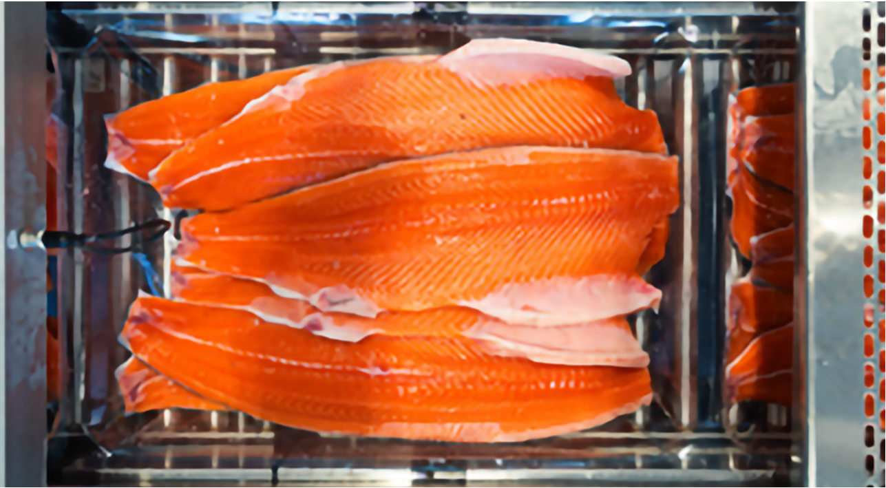
The facility has capacity for gutting 70,000 GWT of salmon annually in one shift, 70% as fillets.