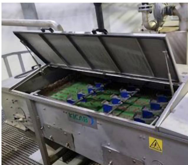
Sludge processing unit at Kjærrelva.