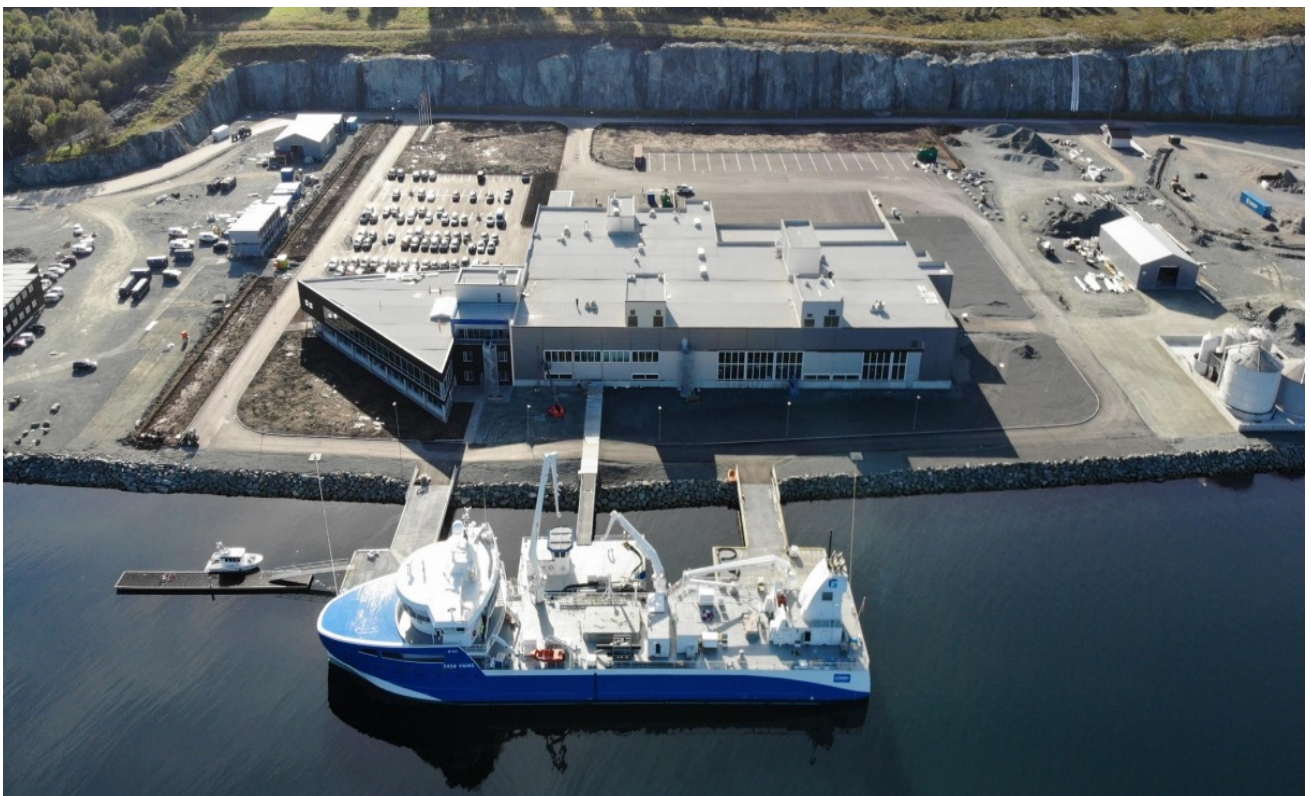
The plant at Jøsnøya seen here with a wellboat discharging salmon

The factory has no emissions other than purified process water and all waste is sorted.